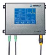
Optidew 501 Chilled Mirror Hygrometer