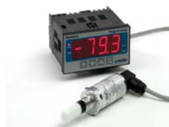
Easidew Online Dew-Point Hygrometer