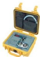
MDM50 Portable Hygrometer