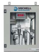
ES20 Compact Sampling System

Michell Instruments 48 Lancaster Way Business Park, Ely, Cambridgeshire, CB6 3NW Tel: +44 1353 658000, Fax: +44 1353 658199, Email: info@michell.com , Web: www.michell.com