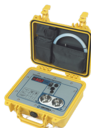
Easidew Portable Hygrometer