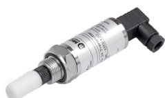
Easidew Tx Industrial Dew-Point Transmitter