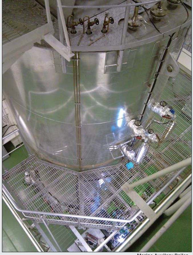
Marine Auxilary Boiler

The sensor is located in an oven inside the sensor head which is bolted directly to the flue/stack. Unlike in-situ analysers the sensor is not in the probe this ensures a longer life, greater accuracy and no chance of thermal shock damaging the sensor.