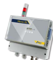
Microx-OL Online Oxygen Analyzer