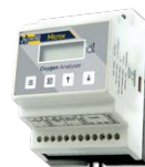
Microx Oxygen Analyzer