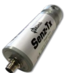
SENZTX Oxygen Transmitter