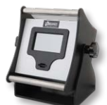
GazTrak Portable oxygen & moisture measurement